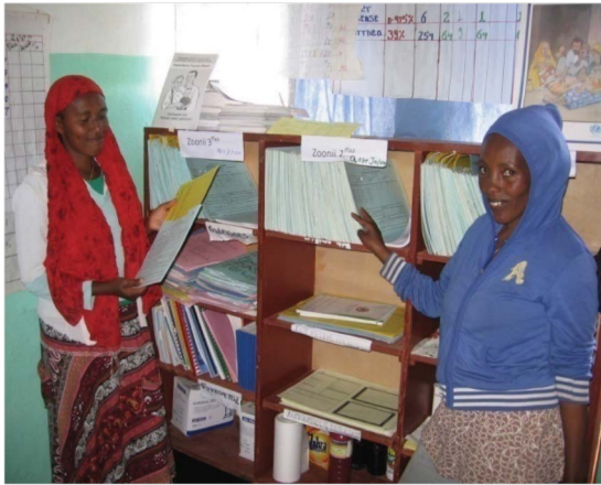
Figure 3: Health Extension Workers in Health Post