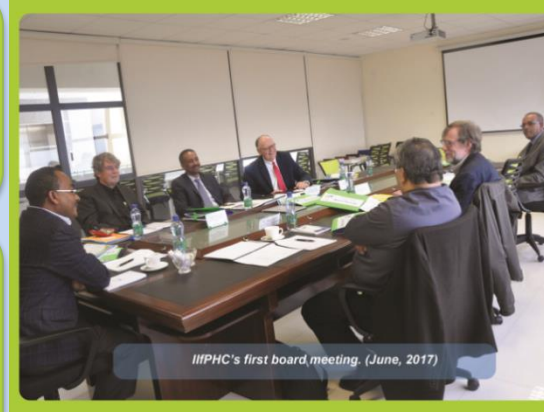
IIIPH-C-E's first board meeting (June, 2017)

To contribute to the revitalization of the global movement of Health for All through PHC