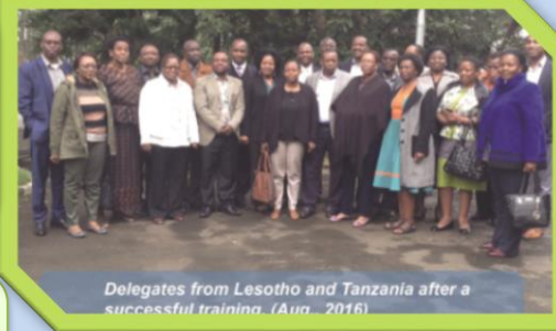
Delegates from Lesotho and Tanzania after a successful training (Aug. 2016)

IIIPH-C-E works toward achieving its vision in three ways: training, research and resource center